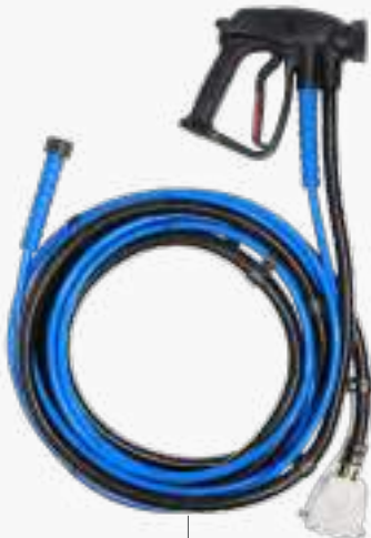
Steam/water hose 5m - 8m - 10m - 15m