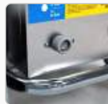
Water mains connection