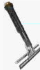
Lance with window cleaner & diffuser 250mm - 350mm - 450mm