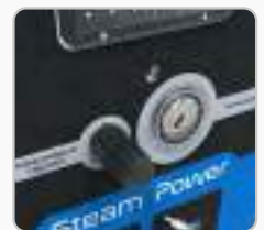
Pump pressure regulator and analogic pressure gauge