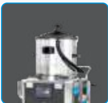
Vacuum cleaner with 14 liters vacuum drum and drainage hose Steam Power Plus only