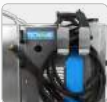
Hose holder, lance holder and high pressure pump level indicator (accessories not included)