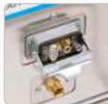
Steam outlet 10 bar - 12P and high pressure water outlet