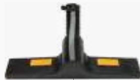
Floor tool L. 375mm