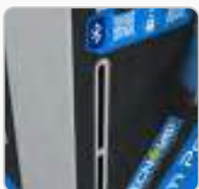
Water tank level indicator