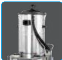
Vacuum cleaner with 43 liters vacuum drum and drainage hose