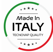
Steam Power Plus