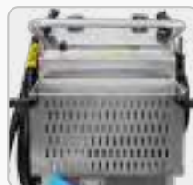
Accessory basket and cable holder