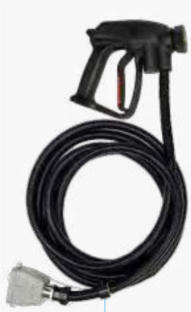
Steam hose 5m - 8m - 10m - 15m