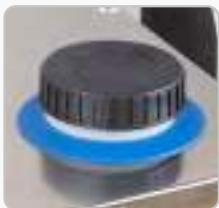
Water tank 14 liters