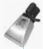
Stainless-steel upholstery tool