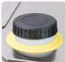
Detergent tank 14 liters