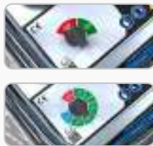
ON/OFF switch Power regulation switch