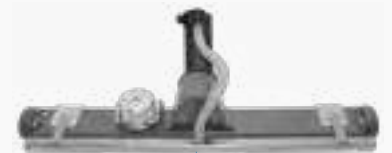
Steam+vacuum industrial brush L. 530mm