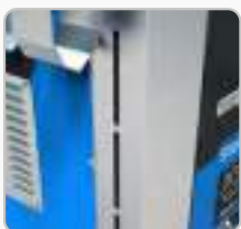
Detergent tank level indicator