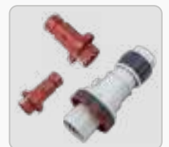
Electric plug with 8m cable: IEC309/16A Mod. 10,8 kW IEC309/32A Mod. 14,4 - 18 - 21,6 kW IEC309/63A Mod. 28,8 - 36 kW