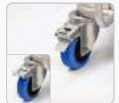
Anti-scratch rubber wheels 360° with safety brakes