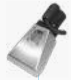
Stainless-steel upholstery tool