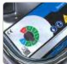
Power switch regulation