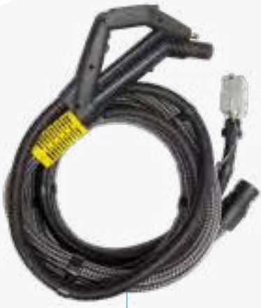
Steam/vacuum hose with control panel 4m - 8m - 12m