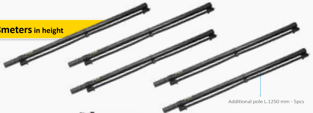
Additional pole L.1250 mm - 5pcs