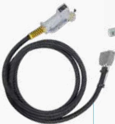
Steam hose 5m - 8m - 10m - 12m