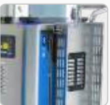
Accessory basket and extension tube holder