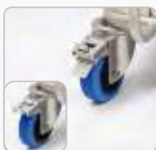
Ruote anteriori in gomma anti-traccia 360° con freno di sicurezza