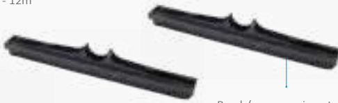
Brush/squeegee insert - 2pcs L. 375mm