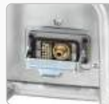
Steam outlet 10 bar - 12P