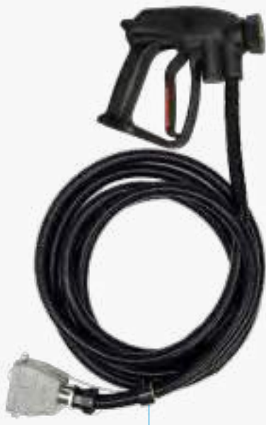
Steam hose 5m - 8m - 10m - 15m