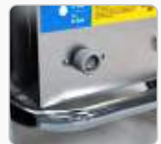
Water mains connection