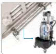
Hook for Vac Industrial (not included)