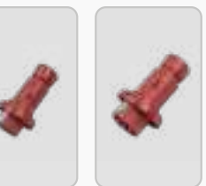
Electric plug with 8m cable: