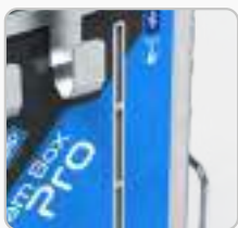
Water tank level indicator