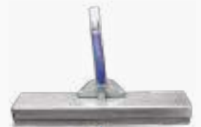
Steam brush with bristles 250mm - 350mm - 450mm to be connected to the Geysier lance