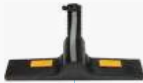
Floor tool L. 375mm