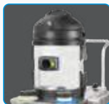
Vacuum cleaner with brush motors