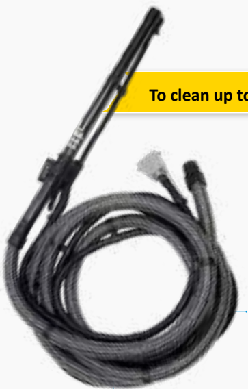
Initial pole L.950mm with control panel & steam/vacuum hose 6m or 8m