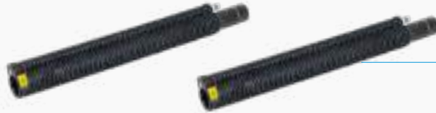
Extension tubes - 2pcs L. 480mm