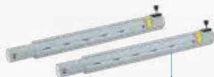
Extension tubes L. 480mm