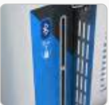
Detergent tank level indicator