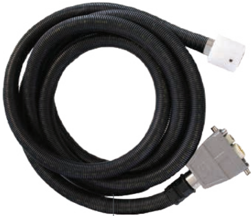
Bacchus foodgrade silicone hose 4m - 8m - 10m

Bacchus Static can be used with following accessories: