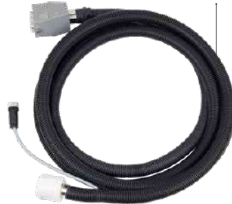
Bacchus foodgrade silicone hose predisposed for pressure switch connection 4m - 8m - 10m